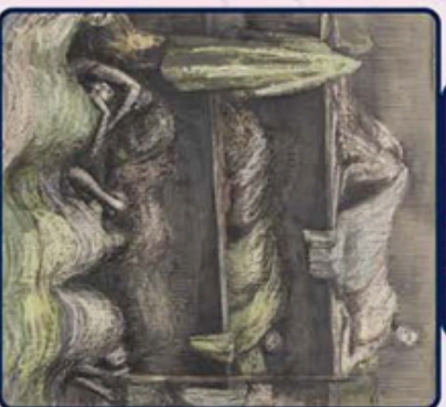
Shelter-scene: bunkers and sleepers (1941)