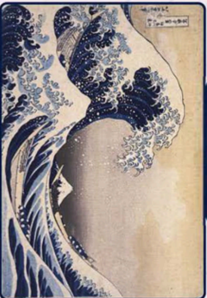
The Great Wave (1829-1833)